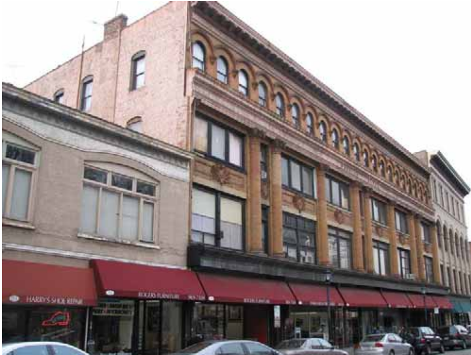
Photograph 108. Structure 196, 15-23 North Broadway. A four-story brick masonry commercial structure, known as the Wheeler Block, constructed c.1890.