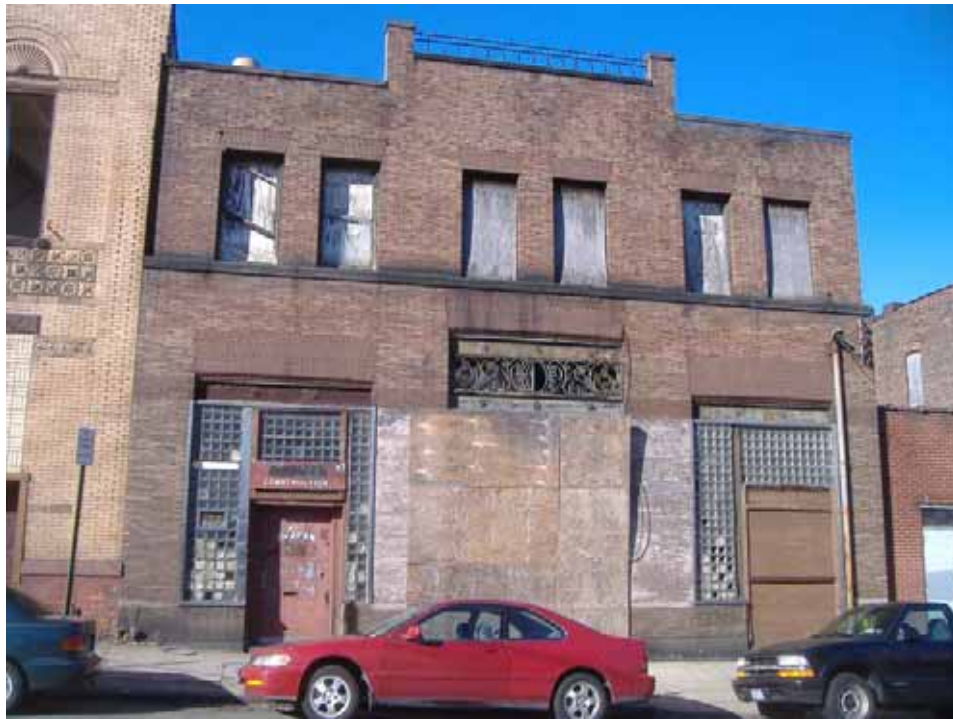
Photograph 70. Structure 128, 47 Buena Vista Avenue. A two-story brick structure constructed c. 1895 as an annex to Teutonia Hall.