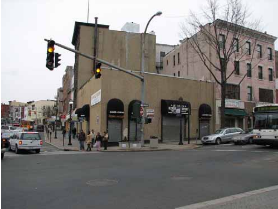
Photograph 93. Structure 170, 27 Main Street. A one-story commercial building, presently covered with stucco. Initially constructed in the early 20 th century.