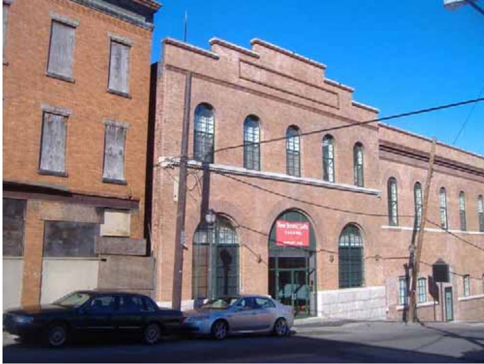
Photograph 69. Structure 125, [41] Buena Vista Avenue. A two-story brick power house attached to Yonkers Trolley Barn (Structure 124), constructed c. 1903.