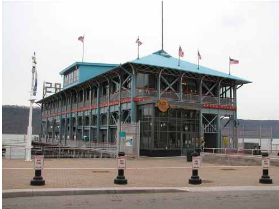
Photograph 67. Structure 122, Yonkers Recreational Pier on Main Street at Hudson River. A two-story cast iron pier, constructed in 1901.