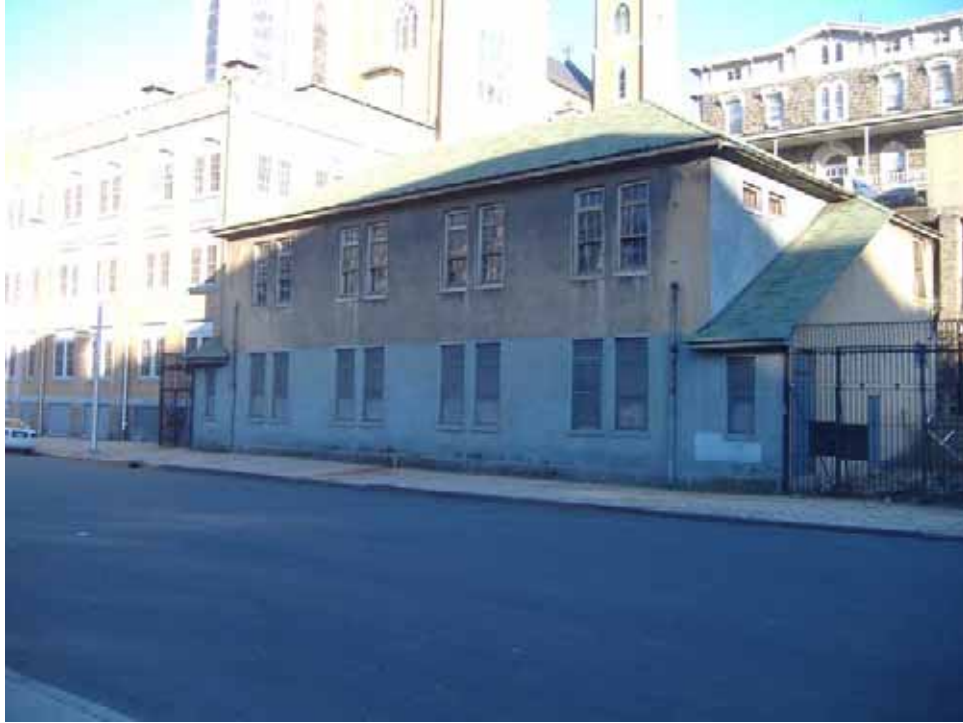
Photograph 63. Structure 113, [24] St. Casimir Avenue. A two-story concrete building with intact windows, constructed c. 1910.