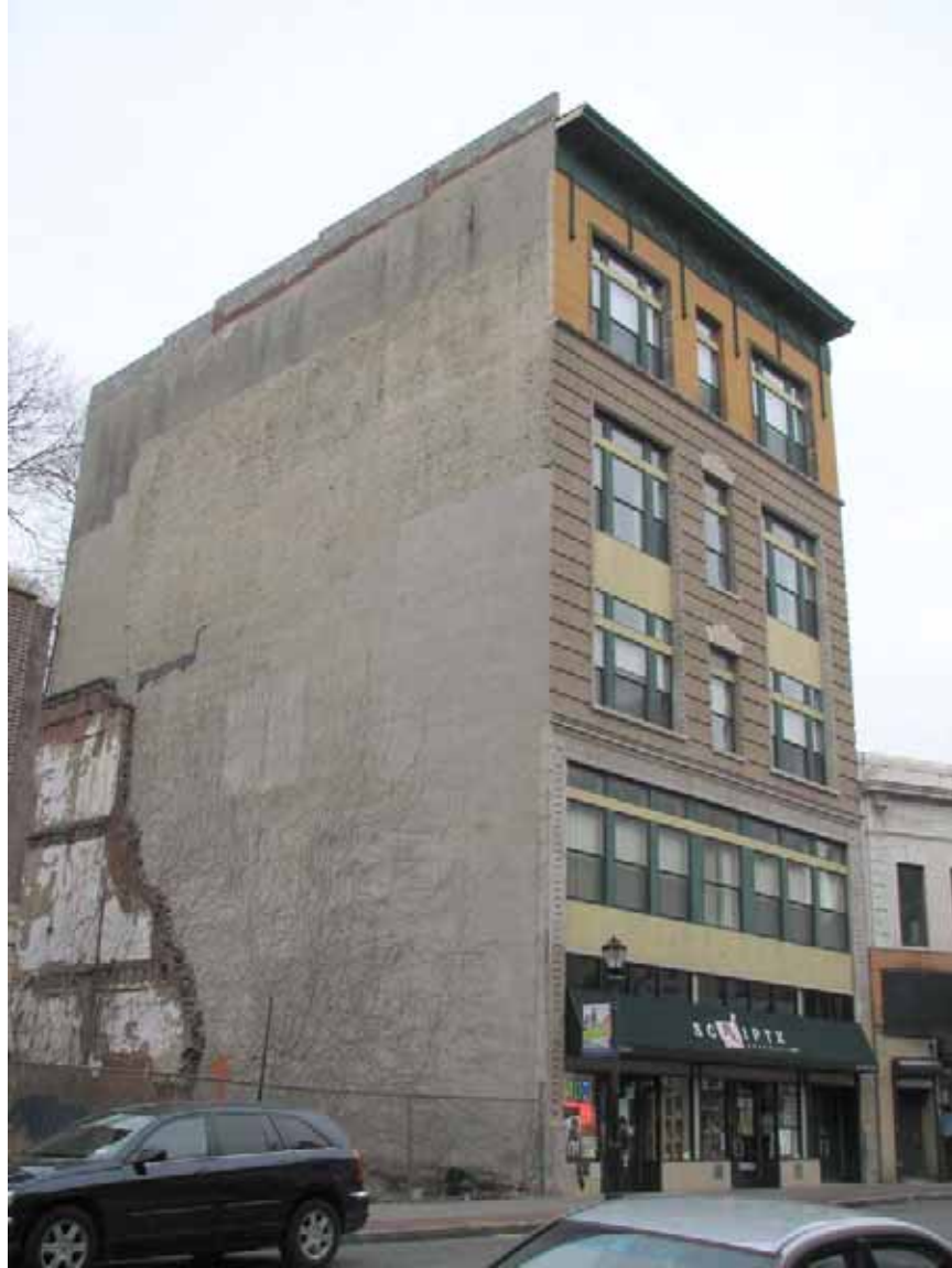
Photograph 113. Structure 202, 14 North Broadway. A five-story brick mixed-use structure, constructed c.1890.