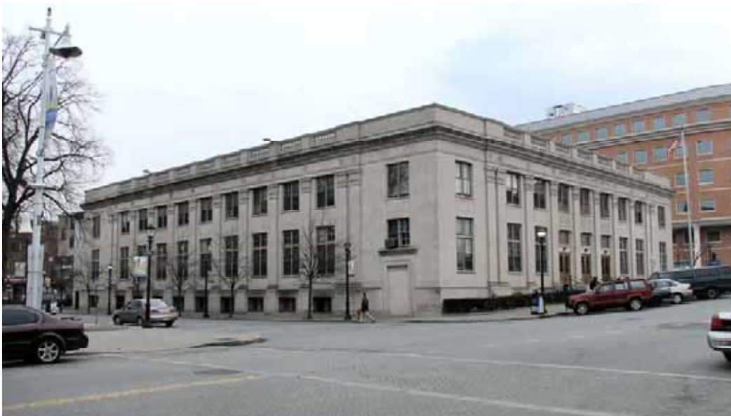
Photograph 74. Structure 135, 79-81 Main Street. The Yonkers U.S. Post Office is a two-story Classical Revival structure with limestone panels, constructed in 1927 under supervision of architect James A. Wetmore.