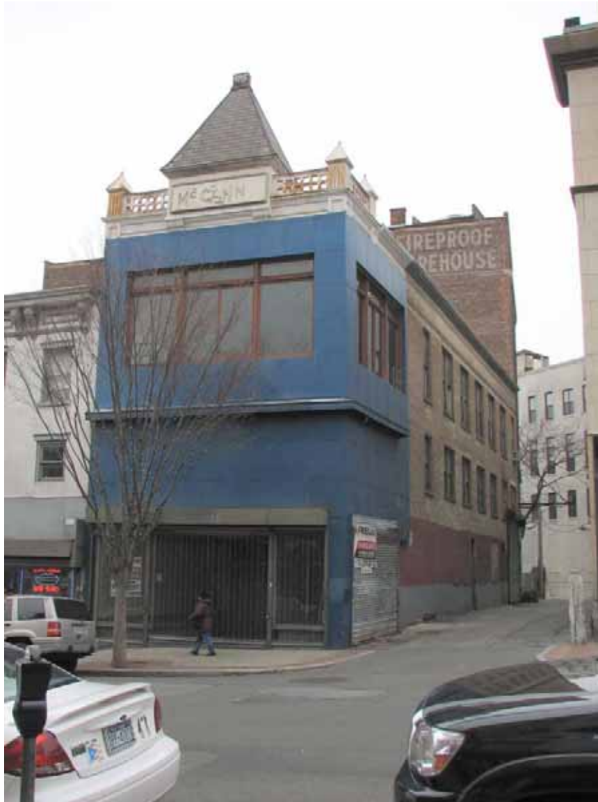
Photograph 96. Structure 176, 13 Main Street. A three-story brick structure with large fireproof warehouse attached constructed c.1900, with c.1930 alterations to the commercial front.