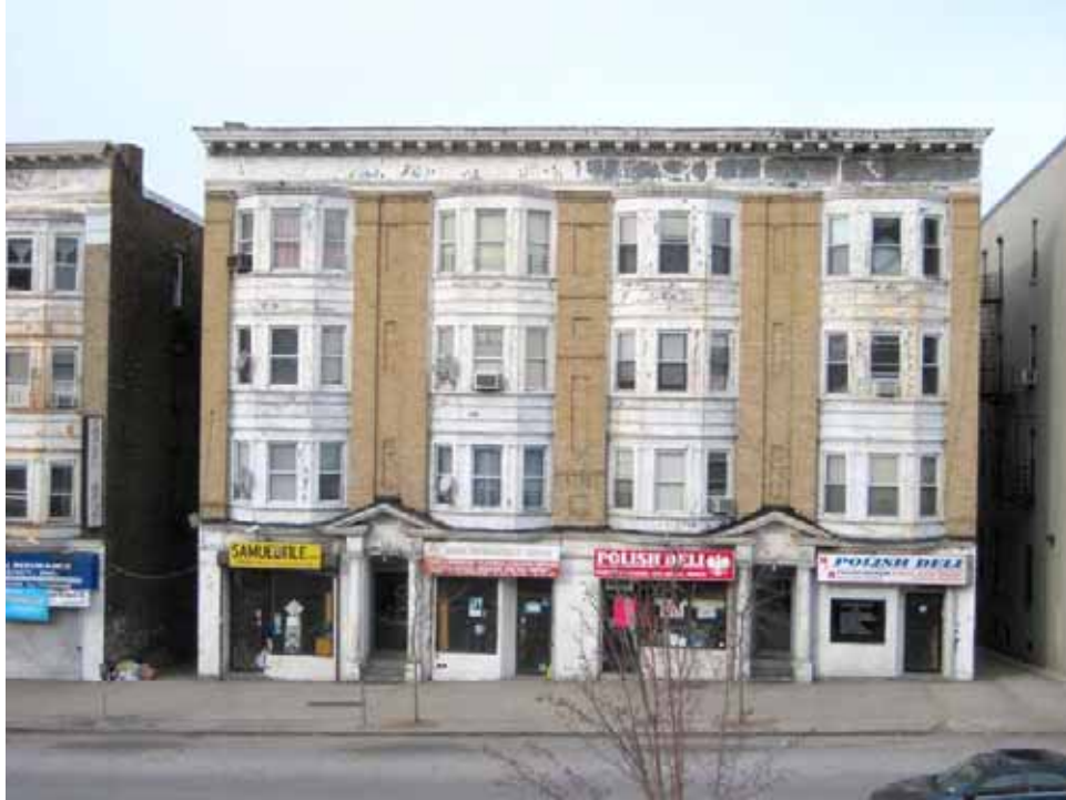
Photograph 65. Structure 116, 223-225 Nepperhan Avenue. A four-story brick mixed-use building, constructed c. 1900.