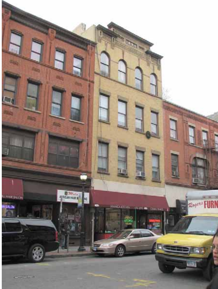
Photograph 111. Structure 199, 24-24B North Broadway. A four-story brick masonry mixed-use building with brick cornice, constructed in 1890.