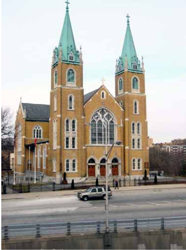
Photograph 62. Structure 112, 259 Nepperhan Avenue. St. Casmir Roman Catholic Church, a gothic style brick church, constructed in 1925.