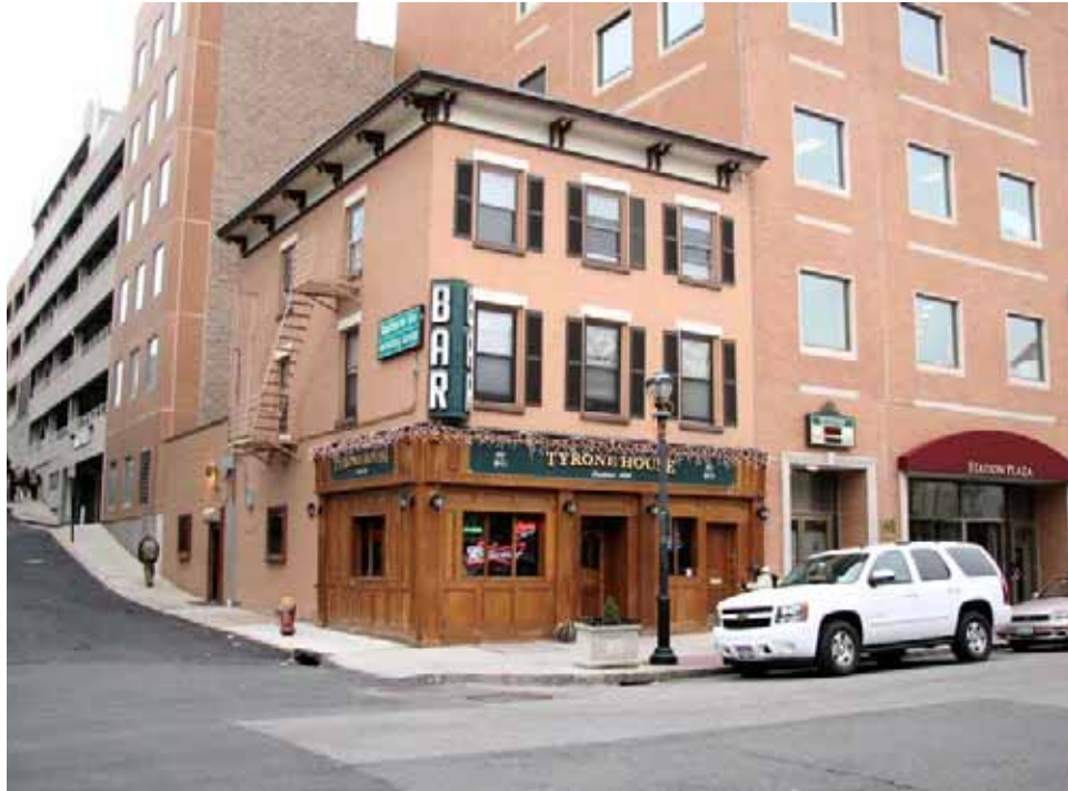
Photograph 76. Structure 139, 72 Main Street. A three-story brick mixed-use building with Italianate brackets, constructed c. 1875.