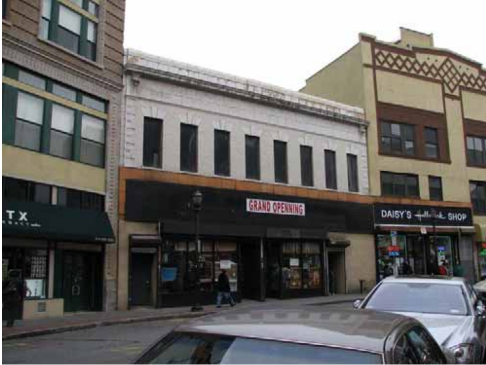
Photograph 114. Structure 203, 10 North Broadway. A two-story brick commercial structure with limestone cornice, constructed c.1920.