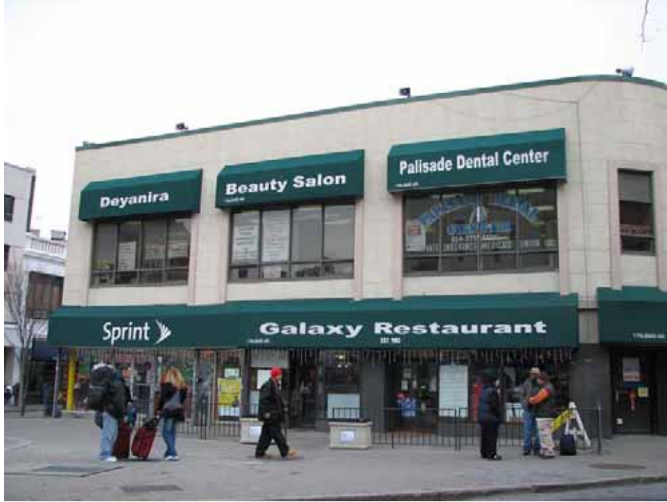
Photograph 116. Structure 205, 1 Palisade Avenue. A two-story masonry commercial structure, constructed c.1930.