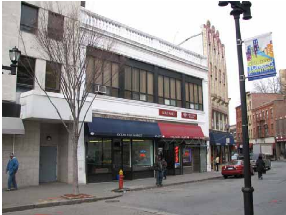
Photograph 105. Structure 193, 5-7 North Broadway. A two-story mixed-use commercial building, constructed c.1900.