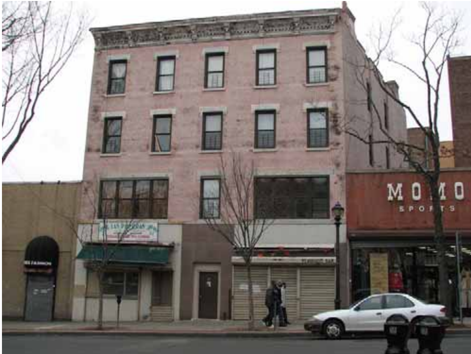
Photograph 94. Structure 172, 25 Main Street. A four-story brick mixed-use structure with a cornice consisting of brackets, dentil molding and vine motifs, constructed c. 1880.