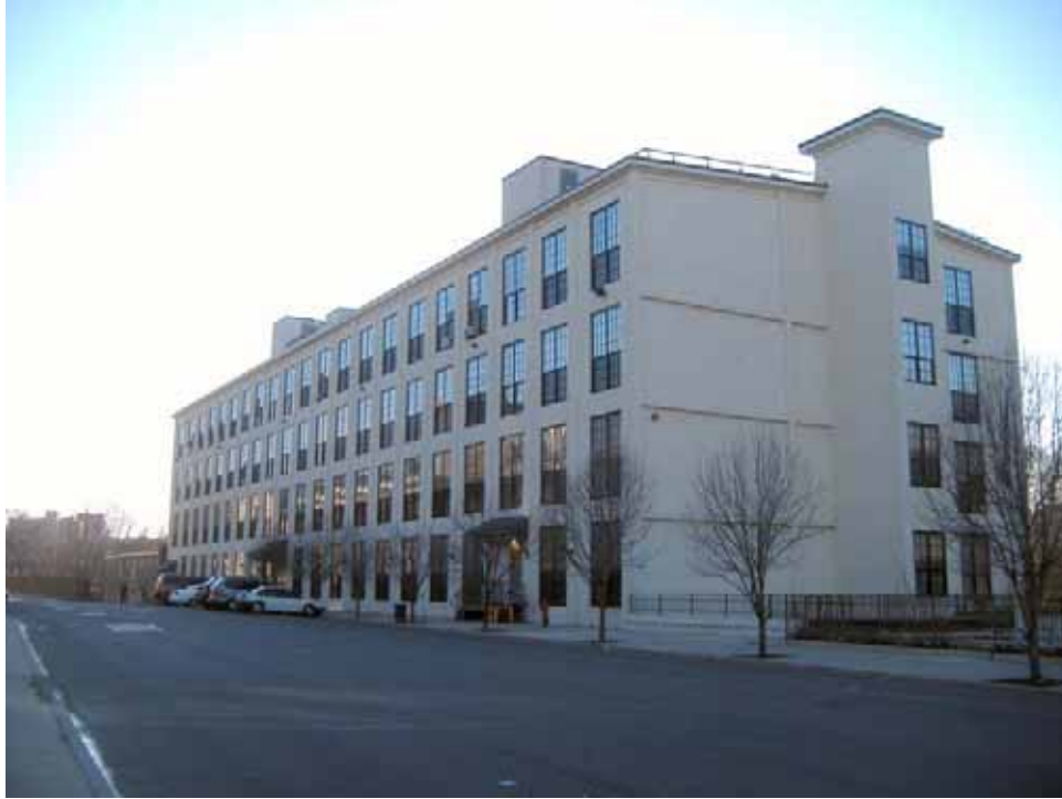
Photograph 60. Structure 110, 23 St. Casmir Avenue. A four-story concrete industrial building, constructed in 1906 as part of Mott Mill.