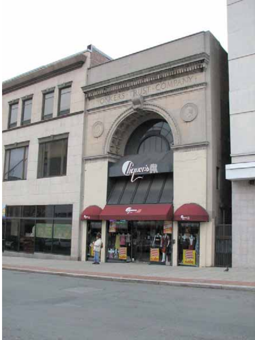
Photograph 104. Structure 191, 3 Main Street. A two-story brick masonry building with stone front, formerly Yonkers Trust Company, constructed c.1910.