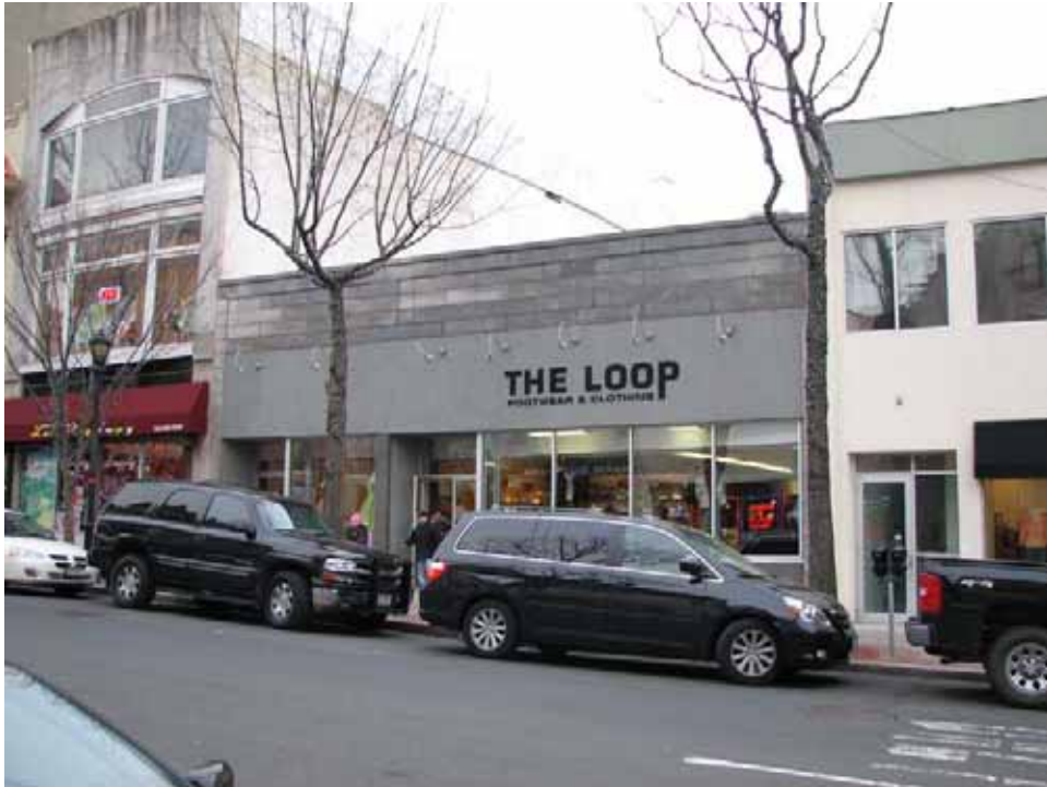
Photograph 98. Structure 178, 18-20 Main Street. A one-story marble-faced commercial structure, constructed during the first quarter of the 20 th century.