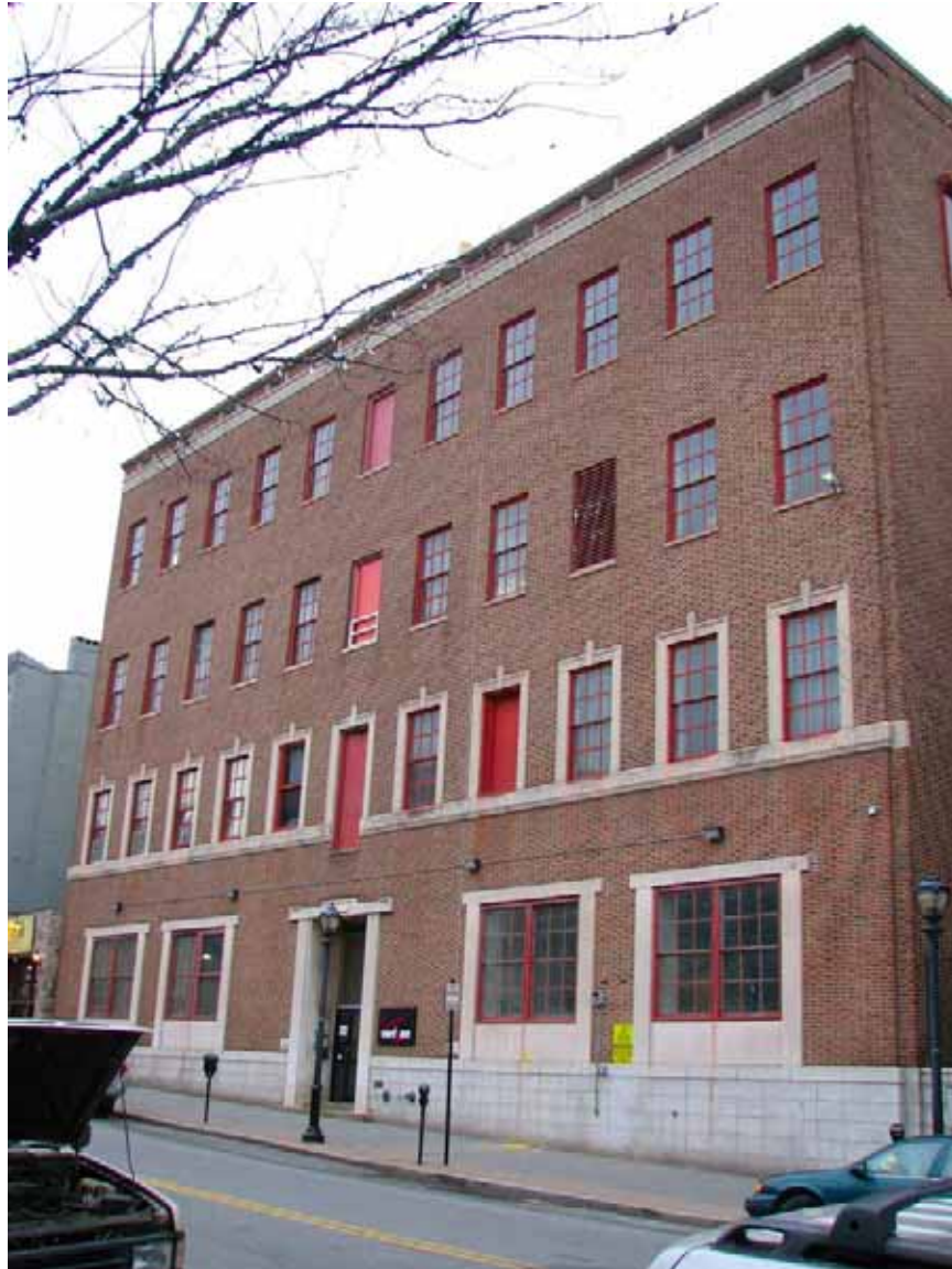
Photograph 78. Structure 144, 40 Main Street. A four-story brick industrial structure, constructed c. 1930.