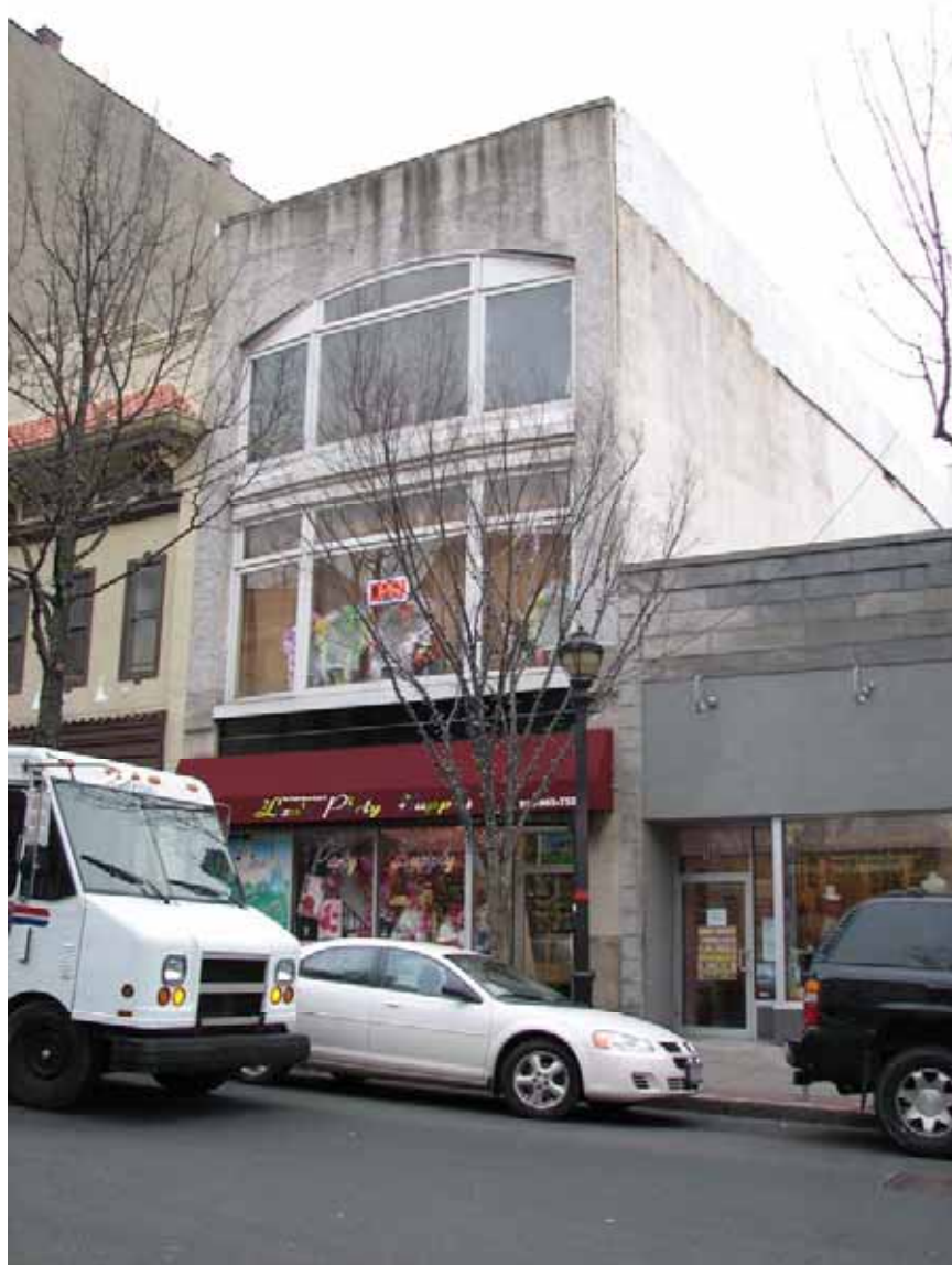
Photograph 99. Structure 179, 16 Main Street. A three-story brick mixed-use building with stucco front, constructed c. 1900.