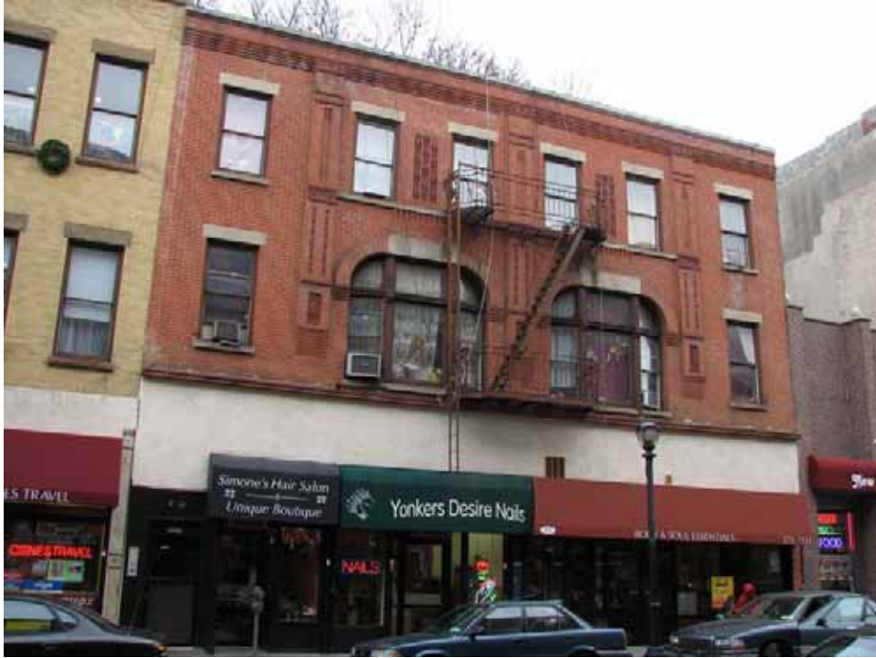
Photograph 112. Structure 200, 20-22 North Broadway. A three-story brick masonry mixed-use structure with decorative brick pilasters, constructed c.1900.