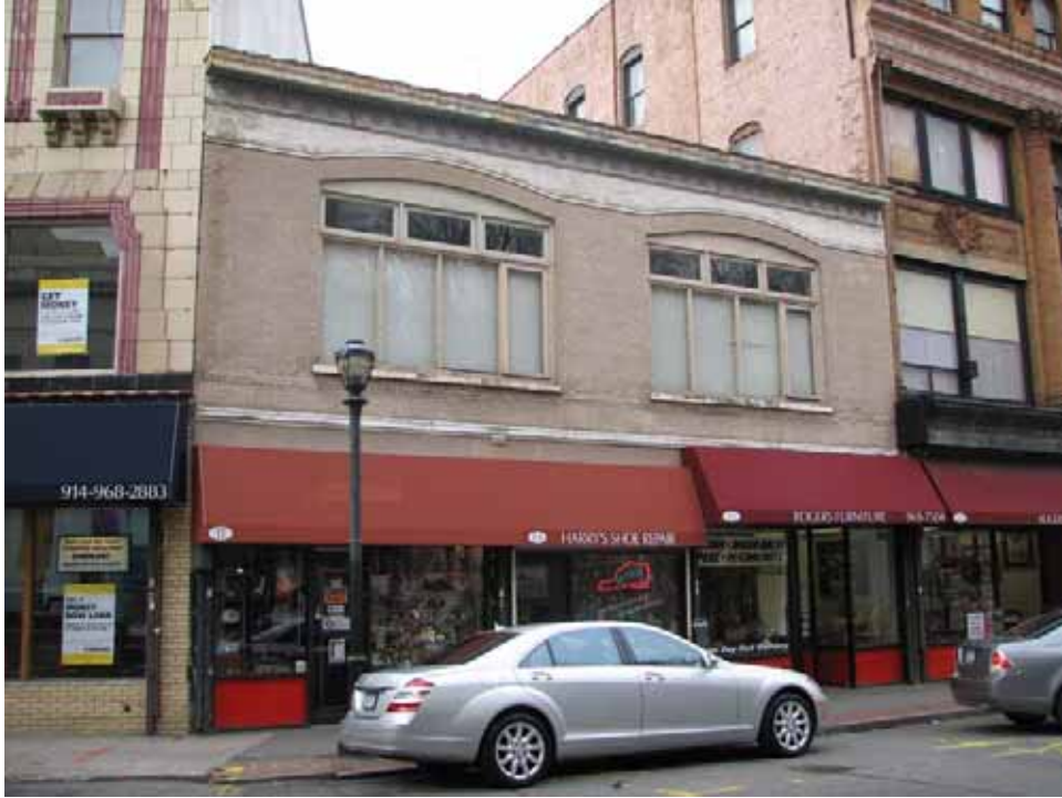
Photograph 107. Structure 195, 11-13 North Broadway. A two-story brick mixed-use structure, constructed c.1900.