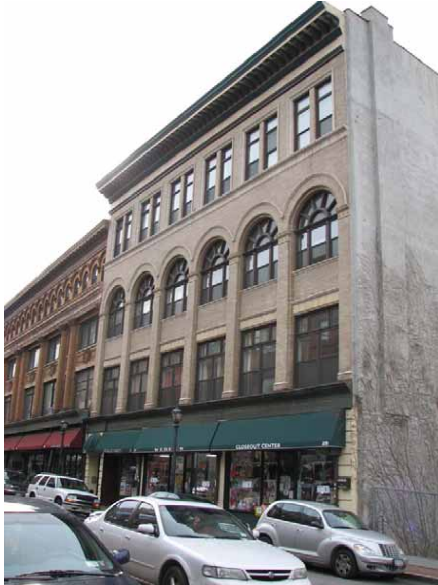
Photograph 109. Structure 197, 25A-29 North Broadway. A four-story brick commercial structure, formerly known as the McCann Building, constructed c.1895.