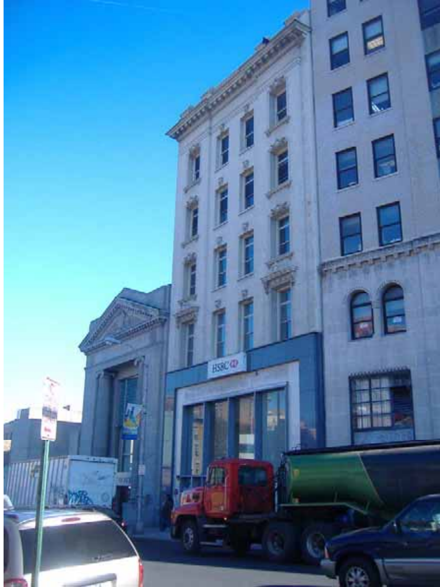
Photograph 117. Structure 206, 16 South Broadway. A five-story commercial structure, formerly Manhattan Savings Bank, constructed c.1900.