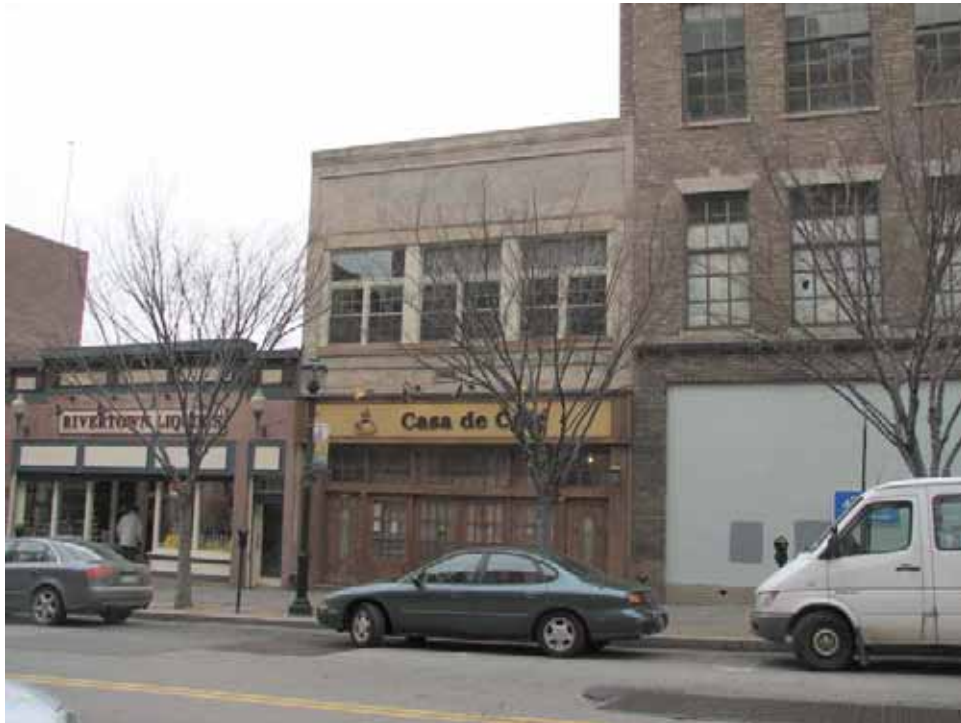
Photograph 86. Structure 156, 41 Main Street. A two-story brick mixed-use structure, constructed c.1920.