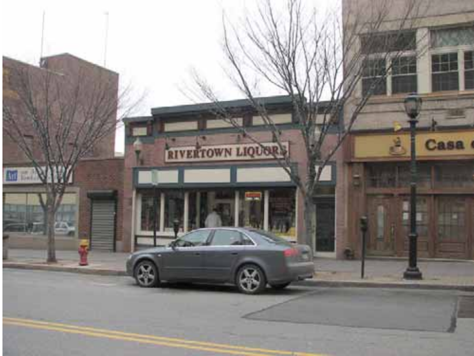
Photograph 85. Structure 155, 47 Main Street. A one-story brick commercial structure with intact storefront, constructed c. 1900.