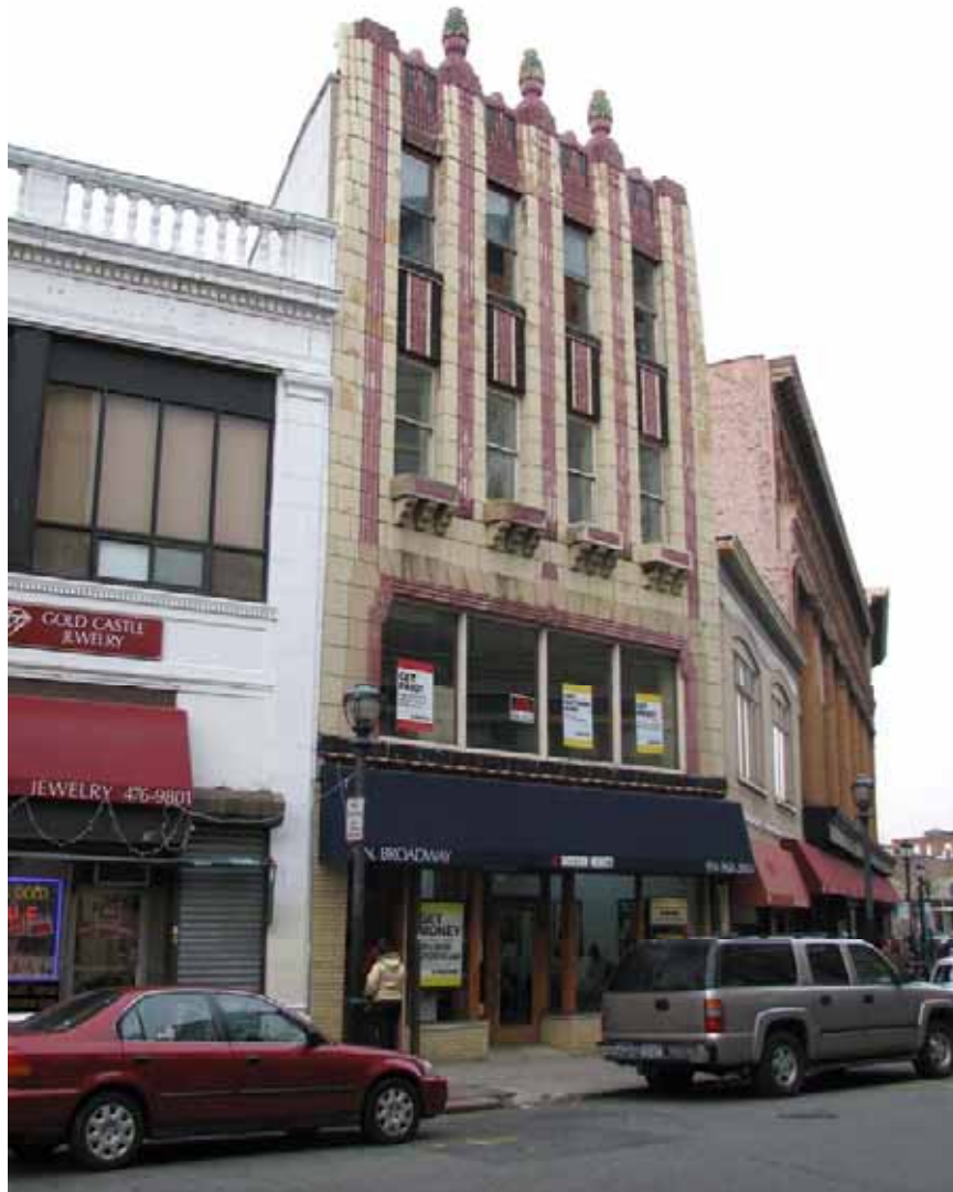
Photograph 106. Structure 194, 9 North Broadway. Formerly known as the Hudson Residence, this four-story terracotta fronted building retains its elaborate details, and was constructed c.1925.