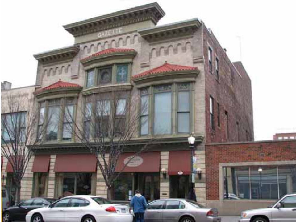
Photograph 84. Structure 152, 55 Main Street. The former Gazette Building is a three-story brick commercial structure, constructed c. 1890.