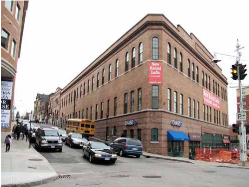
Photograph 68. Structure 124, 92 Main Street. The Yonkers Trolley Barn is a three-story brick building, constructed in 1903.