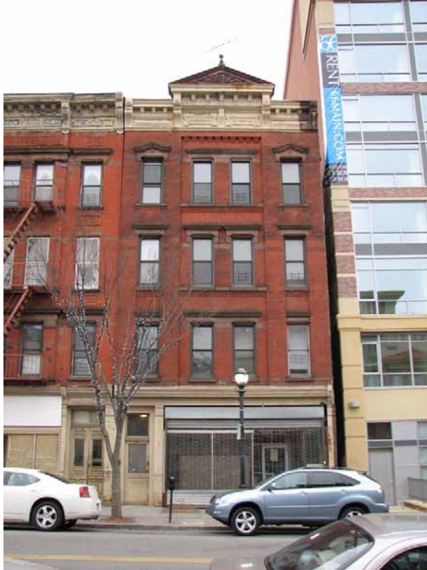
Photograph 82. Structure 149, 52 Main Street. A four-story brick mixed-use building with brownstone window hoods and Italianate pressed metal cornice, constructed c.1875.