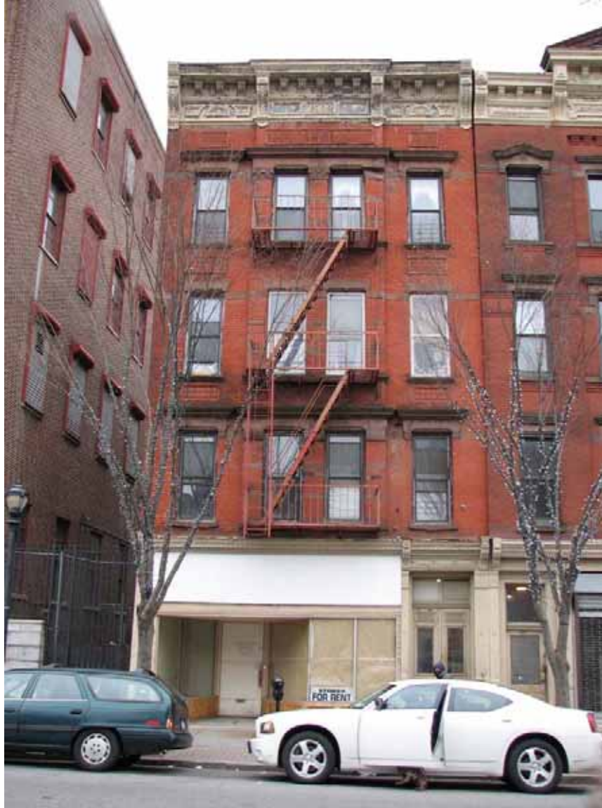
Photograph 81. Structure 148, 50 Main Street. A four-story brick mixed-use building with brownstone window hoods and Italianate pressed metal cornice, constructed c.1875.