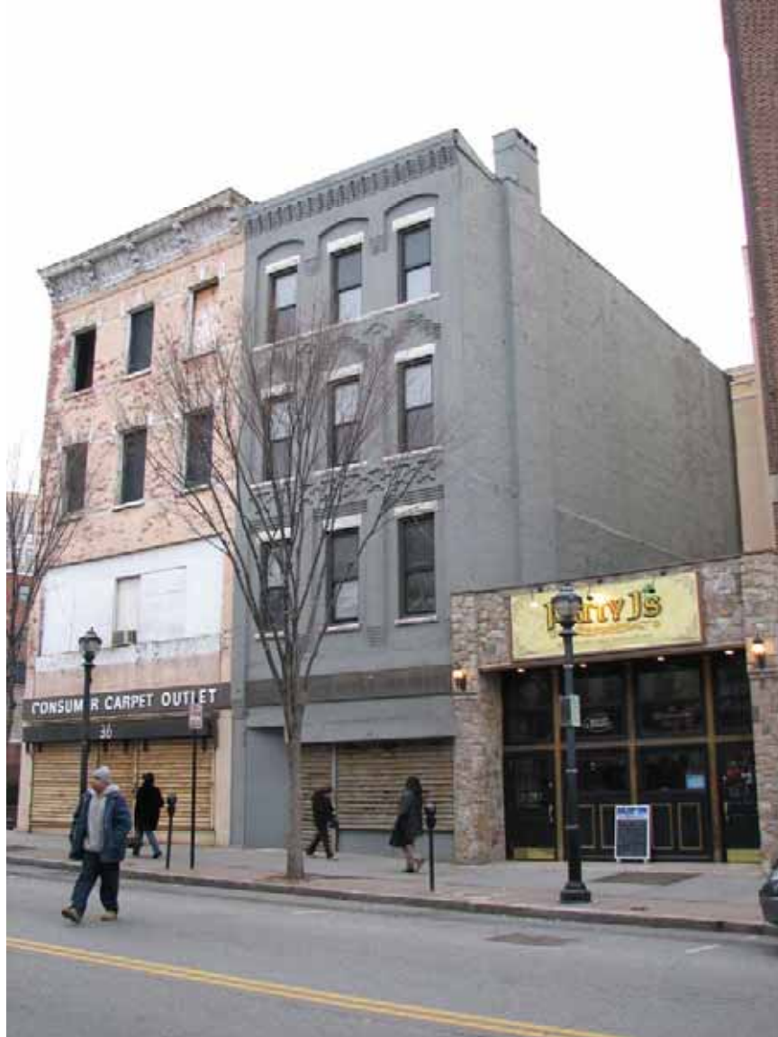
Photograph 80. Structure 147, 38 A Main Street. A four-story brick mixed-use structure with decorative brickwork, constructed c.1885.