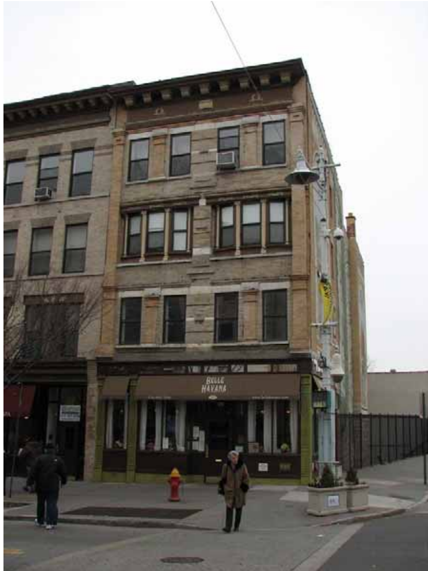
Photograph 89. Structure 160, 35 Main Street. A four-story brick mixed-use structure with cast iron columns and pressed metal cornice, constructed c.1895.