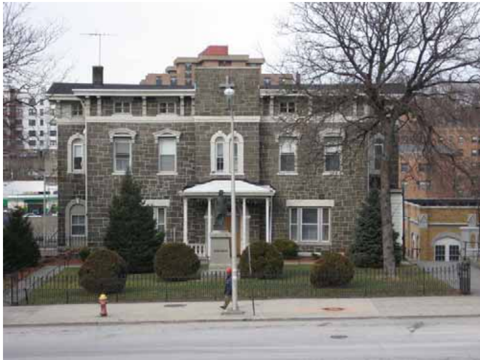
Photograph 64. Structure 114, 239 Nepperhan Avenue, the John Copcutt Mansion, now St. Casimir's Rectory. A 2½-story irregularly coursed granite house with Italianate details, constructed c. 1854.