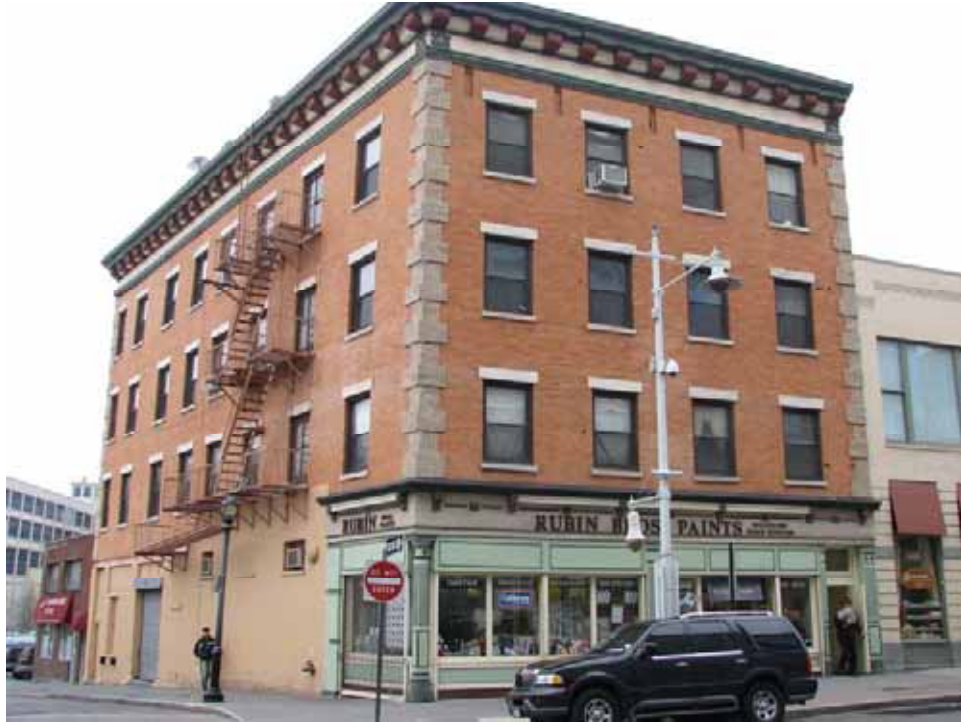
Photograph 75. Structure 137, 63-65 Main Street. A four-story brick masonry mixed-use commercial building with intact storefronts, constructed c. 1895.