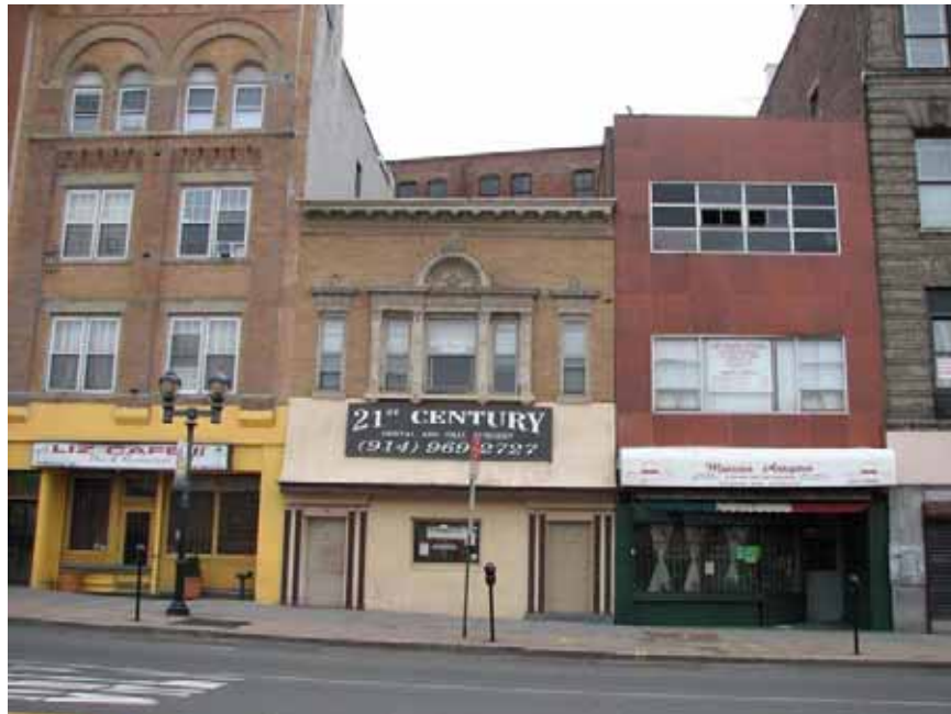
Photograph 91. Structure 167, 12 Warburton Avenue. A two-story brick mixed-use building, formerly known as Decomer Management Company, constructed c. 1900 in the neoclassical style.