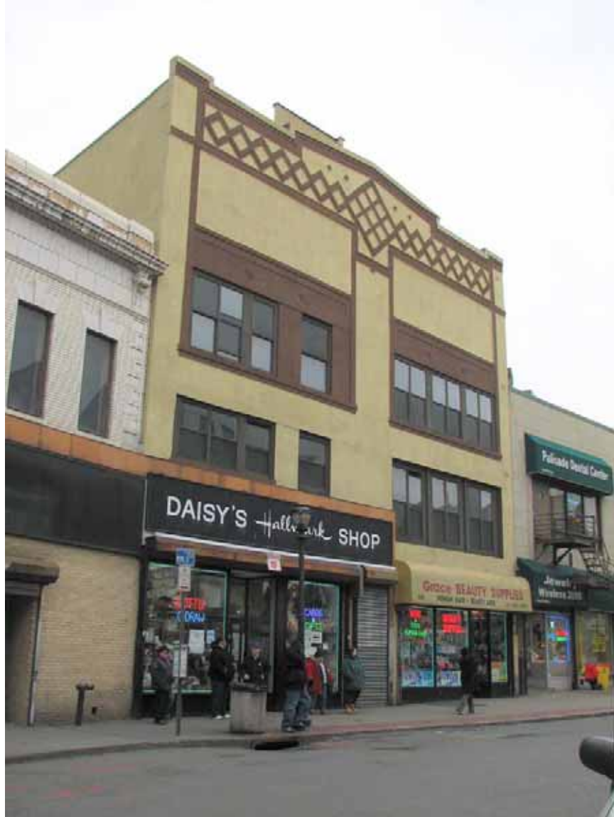
Photograph 115. Structure 204, 6-8 North Broadway. A four-story brick commercial structure with geometric design on cornice, constructed c.1915.