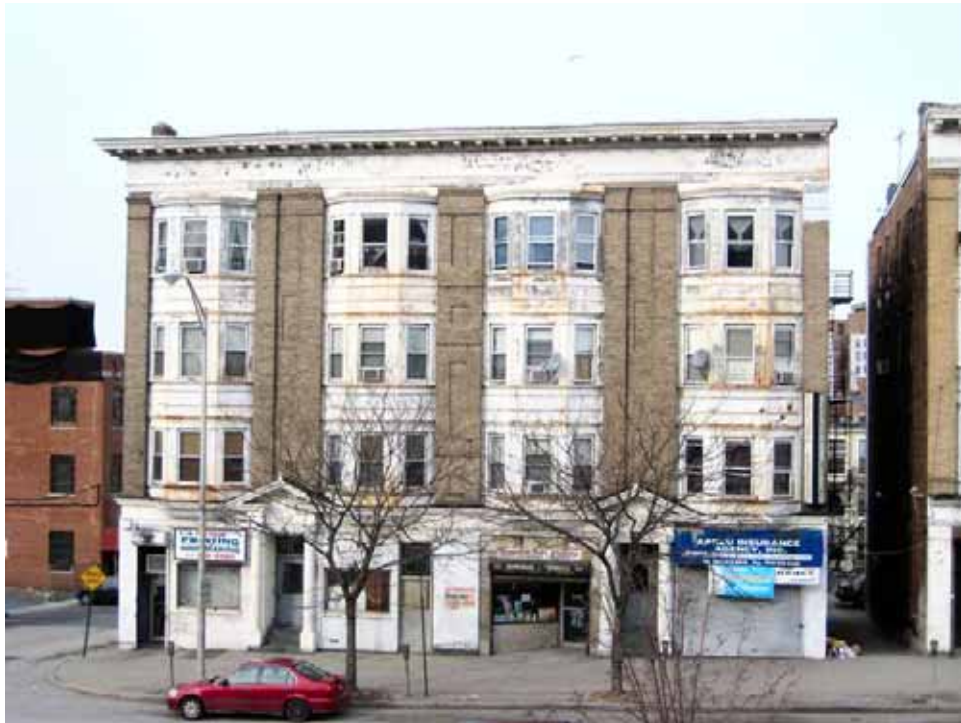
Photograph 66. Structure 117, 219-221 Nepperhan Avenue. A four-story brick mixed-use building, constructed c. 1900.