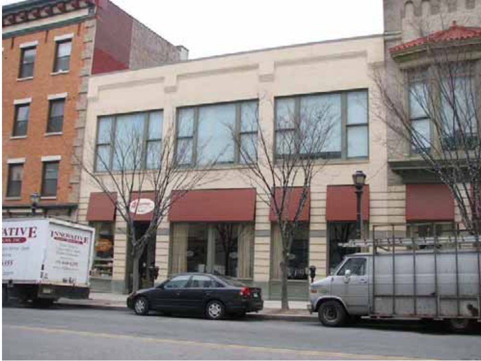
Photograph 83. Structure 150, 61 Main Street. A two-story brick commercial building, constructed during the first quarter of the 20 th century.