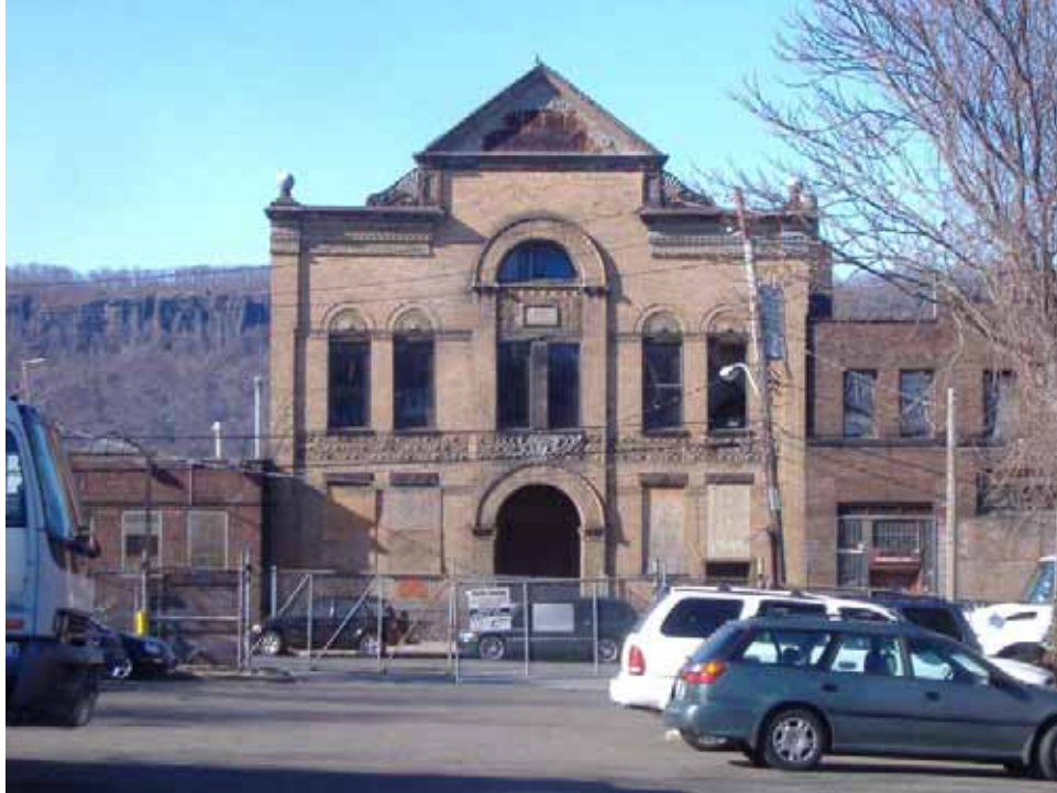
Photograph 71. Structure 129, 49-51 Buena Vista Avenue. Yonkers Teutonia Hall is a two-story masonry building with terra cotta and cast iron details, constructed in 1891.