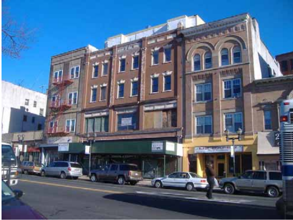
Photograph 90. Structures 164, 165 and 166; 14, 16-18 and 20 Warburton Avenue. These four-story brick mixed-use buildings were constructed during the last quarter of the 19 th century. Structure 14 was formerly known as Revodale Furniture.