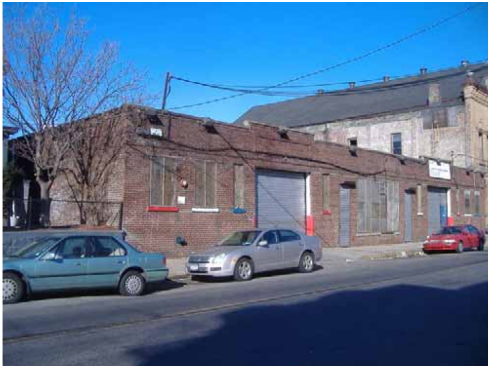
Photograph 72. Structure 130, 53-55 Buena Vista Avenue. A one-story brick masonry industrial building, constructed c. 1915.