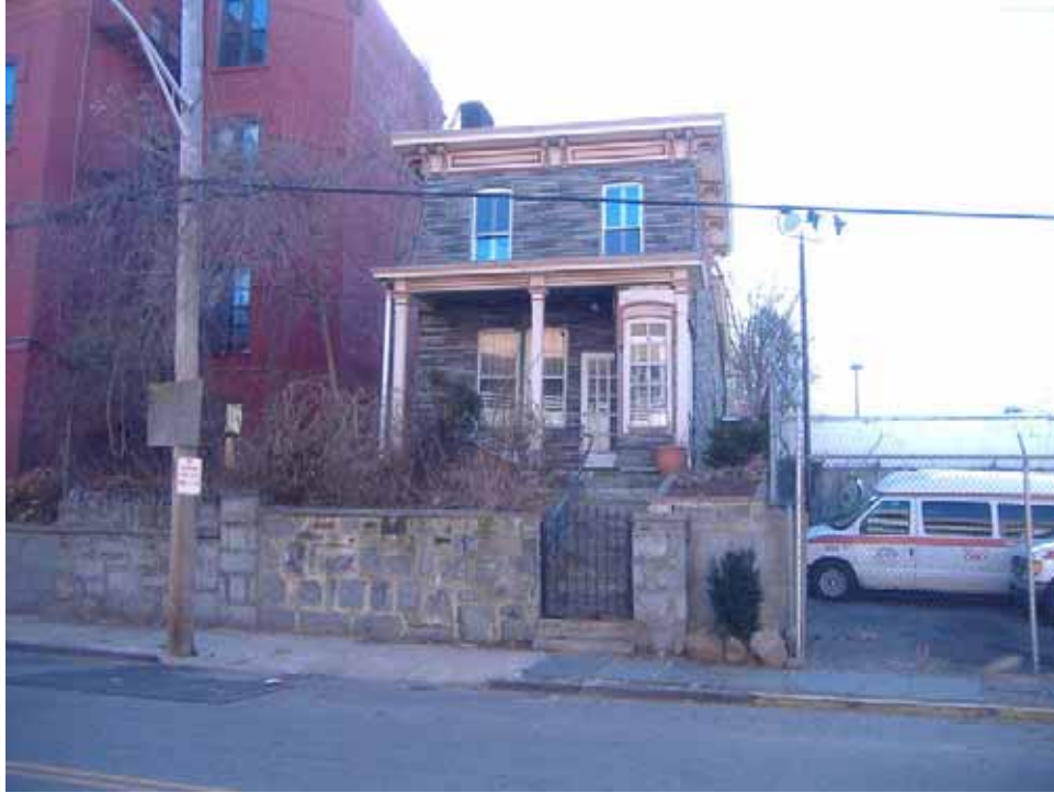
Photograph 73. Structure 132, 64 Hudson Street. A two-story wood-frame house with Italianate details, constructed c. 1880.