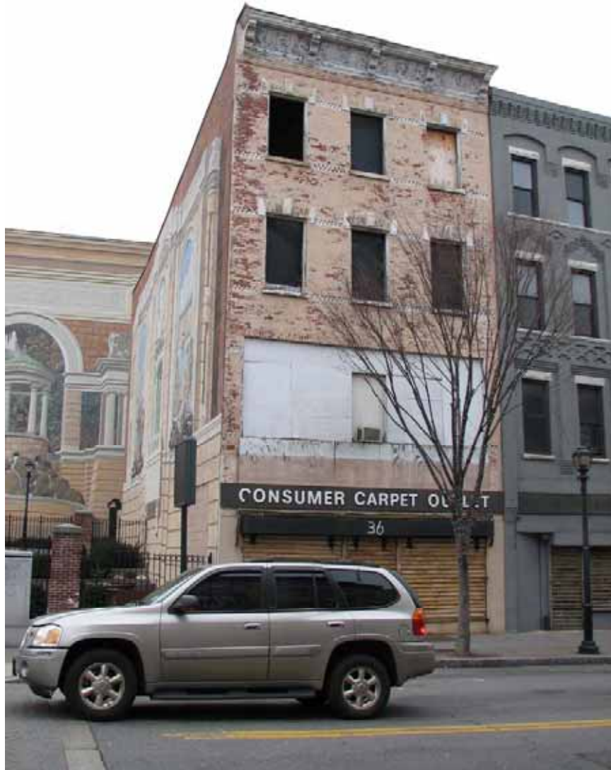
Photograph 79. Structure 145, 36 Main Street. A four-story brick mixed-use structure with Italianate cornice and mural, constructed c.1880.