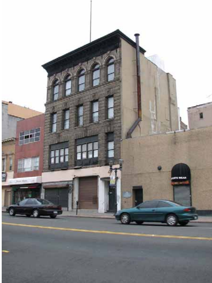
Photograph 92. Structure 169, 4-8 Warburton Avenue. A four-story brick mixed-use structure with terracotta or stone details. Formerly known as Dorothy Furniture, it was constructed c.1895.