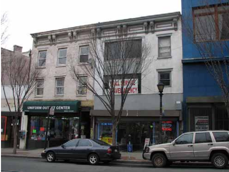
Photograph 95. Structures 174 and 175, 17 and 15 Main Street. A pair of three-story brick masonry mixed-use structures with Italianate detailing, constructed c. 1870.