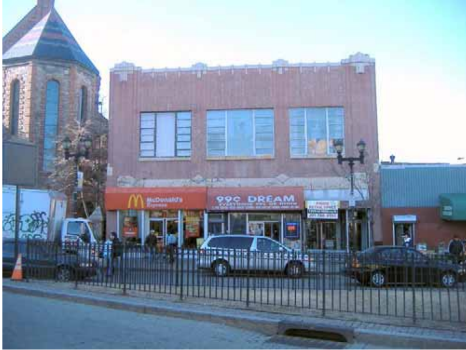
Photograph 102. Structure 187, 5 South Broadway. A two-story brick mixed-use structure with Art Deco details, constructed c.1925.