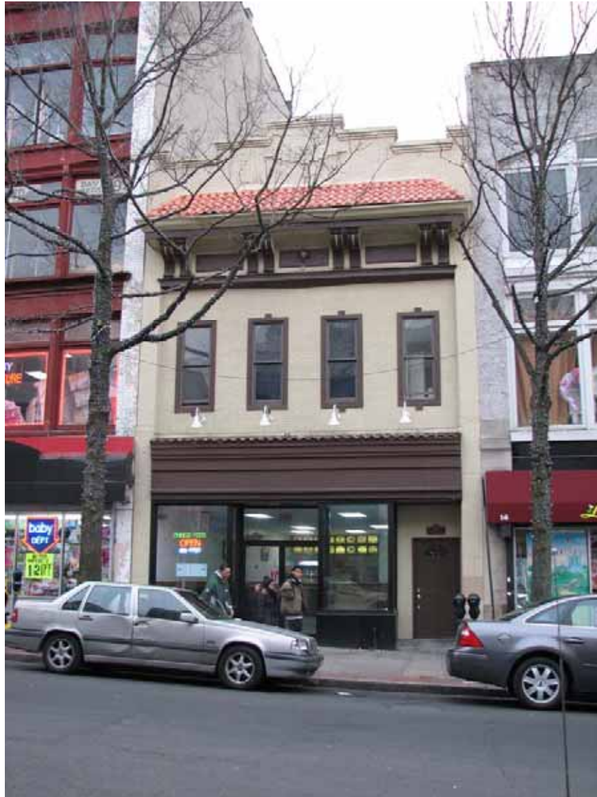
Photograph 100. Structure 180, 14 Main Street. A two-story brick mixed-use building incorporating pantiles and bracketed cornice, constructed c.1900.