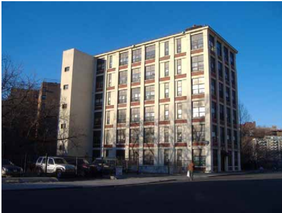
Photograph 61. Structure 111, 35 St. Casmir Avenue. A six-story concrete industrial structure, constructed during the first quarter of the 20 th century.