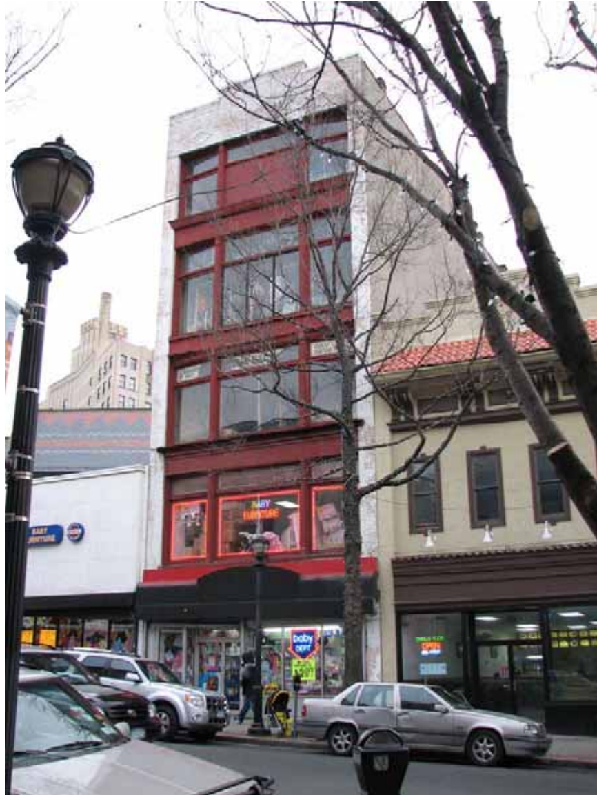
Photograph 101. Structure 181, 12 Main Street. A five-story brick commercial building, constructed c.1900.