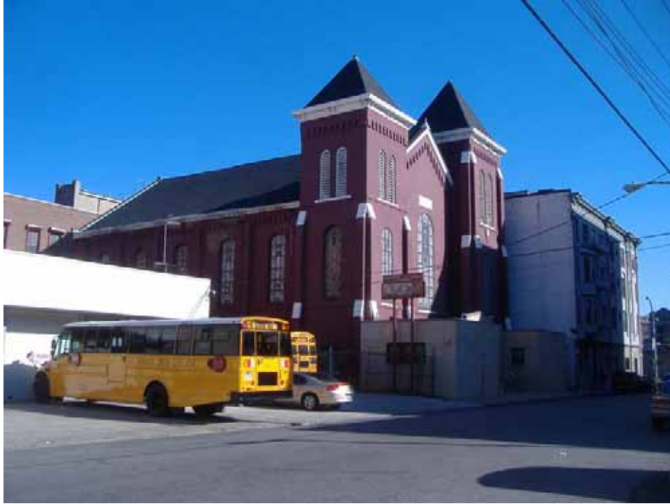
Photograph 77. Structure 143, 21 Hudson Street. The Congregational Queduct, Synagogue is a brick synagogue, constructed c. 1880.