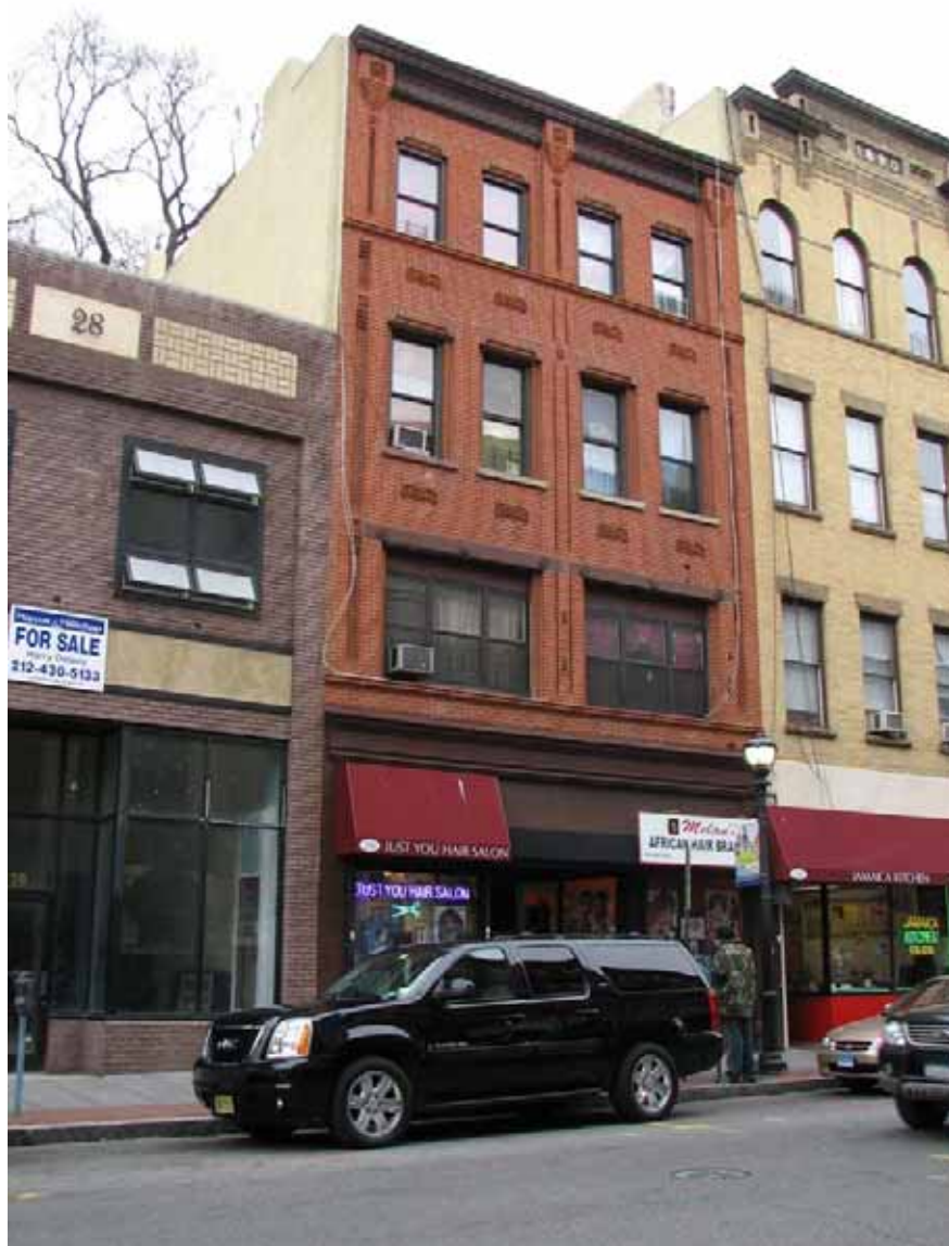
Photograph 110. Structure 198, 26 North Broadway. A four-story brick mixed-use structure with decorative brickwork, constructed c.1890.