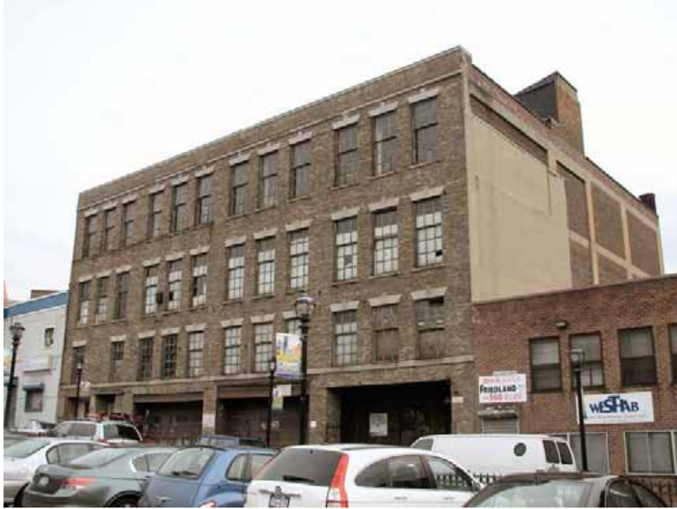
Photograph 87. Structure 157, 28-36 Larkin Plaza. A four-story brick industrial building with intact windows, constructed c.1910.