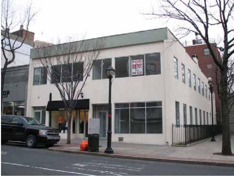
Photograph 97. Structure 177, 22 Main Street. A two-story masonry commercial building, constructed during the first half of the 20 th century.