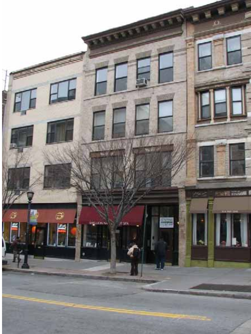
Photograph 88. Structure 159, 37 Main Street. The former Paco Grocery is a four-story brick mixed-use building with Italianate pressed metal cornice, constructed c.1900.